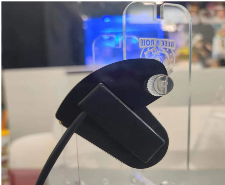
mount the motor bracket