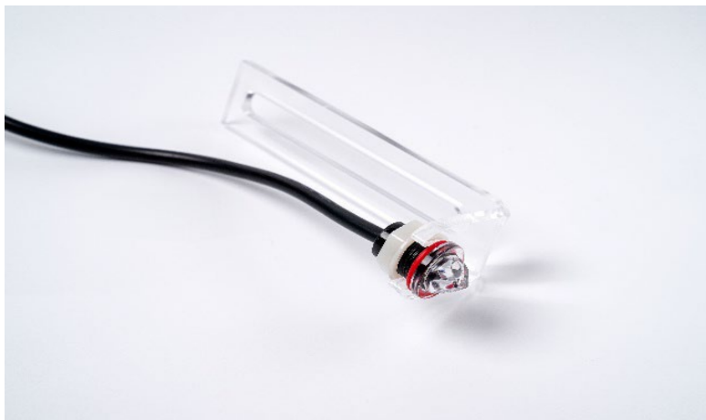
Secure water level sensor (4) on to sensor mount(8)